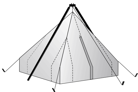
Double Outside Poles

Use the appropriate erection method for the pole system you have purchased. Guy out the walls with the ropes & stakes provided. You may wish to use additional corner poles to hold up the side walls. They will provide a neater installation, especially on uneven ground or in limited spaces.