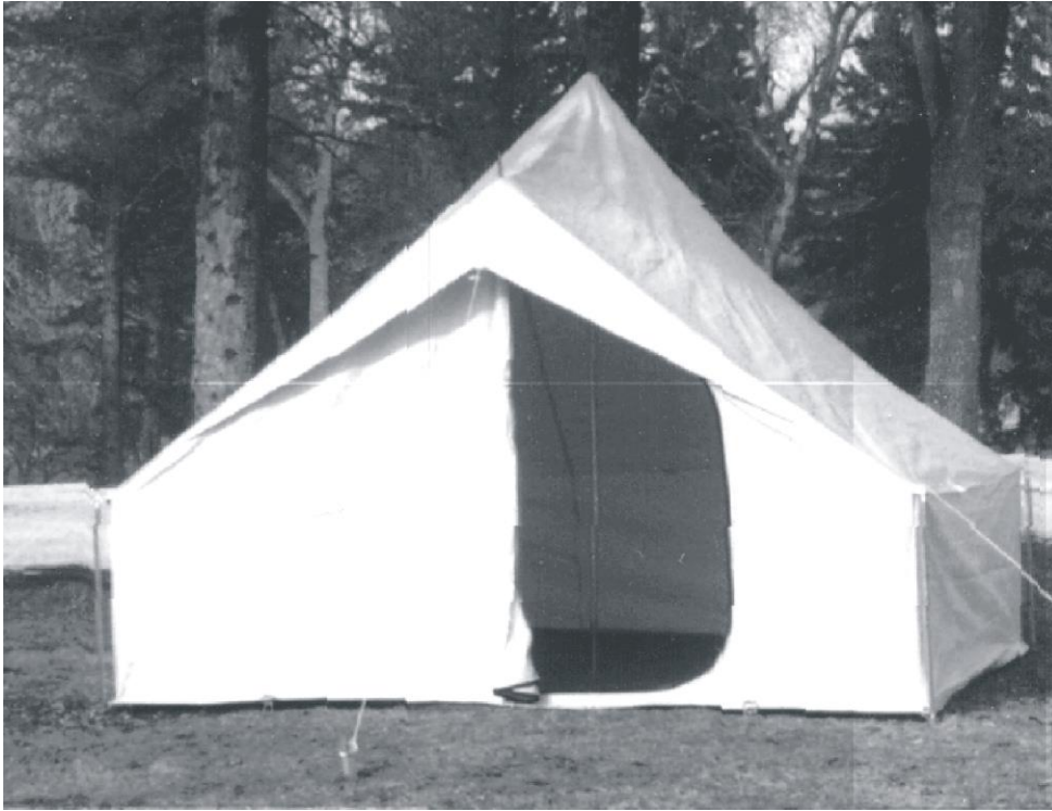
TETON MODEL 10 x 10