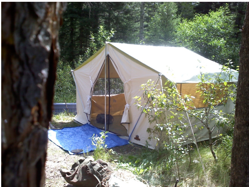
Shown with optional rain fly